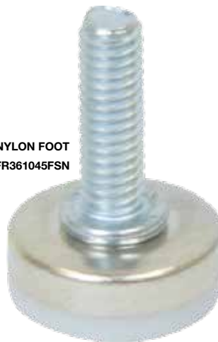
FIXED - STEEL/NYLON FOOT LFR361045FSN