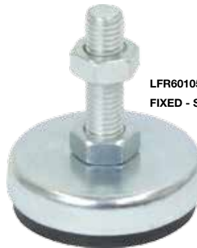
LFR601050FSR FIXED - STEEL/RUBBER FOOT